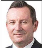
The Hon Mark McGowan MLA

Premier; Minister for Public Sector Management; State Development; Jobs and Trade; Federal-State Relations